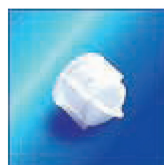
Built in Filter