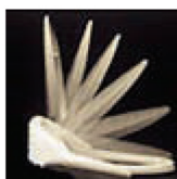
Hydraulic Seat & Lid

EASILY REPLACES MOST STANDARD TOILET SEATS