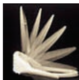
Hydraulic Seat & Lid

EASILY REPLACES MOST STANDARD TOILET SEATS